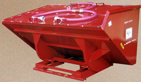
5 cu. yd. Bolted-Down Gasketed Lid