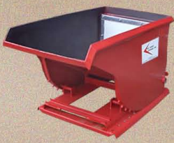
1 cu. yd.

Standard container bodies are constructed of 10 gauge carbon steel.