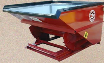
3 cu. yd.