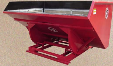
5 cu. yd.