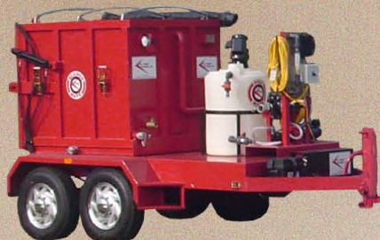
3 cu. yd. with Poly-Mate