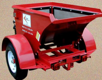
Trailer Mounted models 1 to 3 cu. yd. capacity