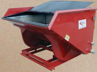
4 cu. yd.