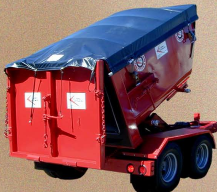
15 cu. yd. Trailer Mounted Container Filter