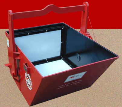
Crane Dumping model