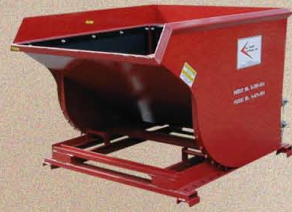
2 cu. yd.